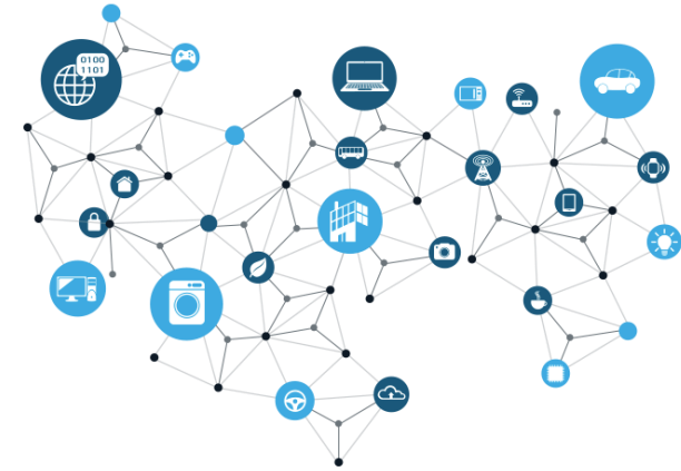
Supporting Smart Homes